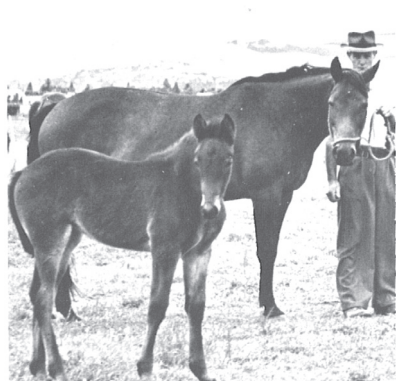
Spangled Maiden, dam of Spangled Queen.